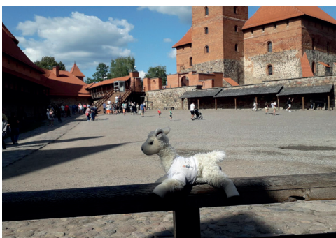
Helsinki, Finland, where he enjoyed touring the city and visiting museums (below).

He then toured around Lithuania, where he enjoyed the Medieval architecture and history, including visiting Trakai Island Castle (centre right). He also spent time in